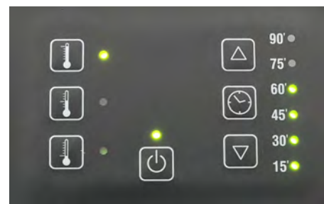
Simple Computer M Type

Drying surely plays a fundamental role in a laundry process: this in fact determines the final result, linen must come out in perfect condition, both as regards the form and the tissue.