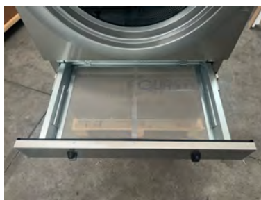
New easy-cleaning and easy-access screen filter